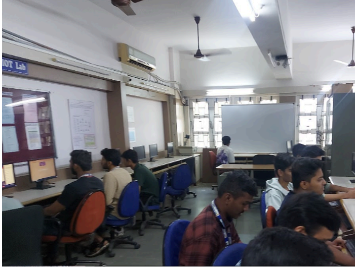
Full Stack (MERN) Workshop

Date: Jan- June 2023 ,Dec 2023 & Jan, 2024