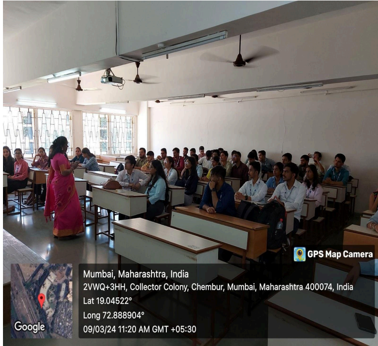
Photos of the Session